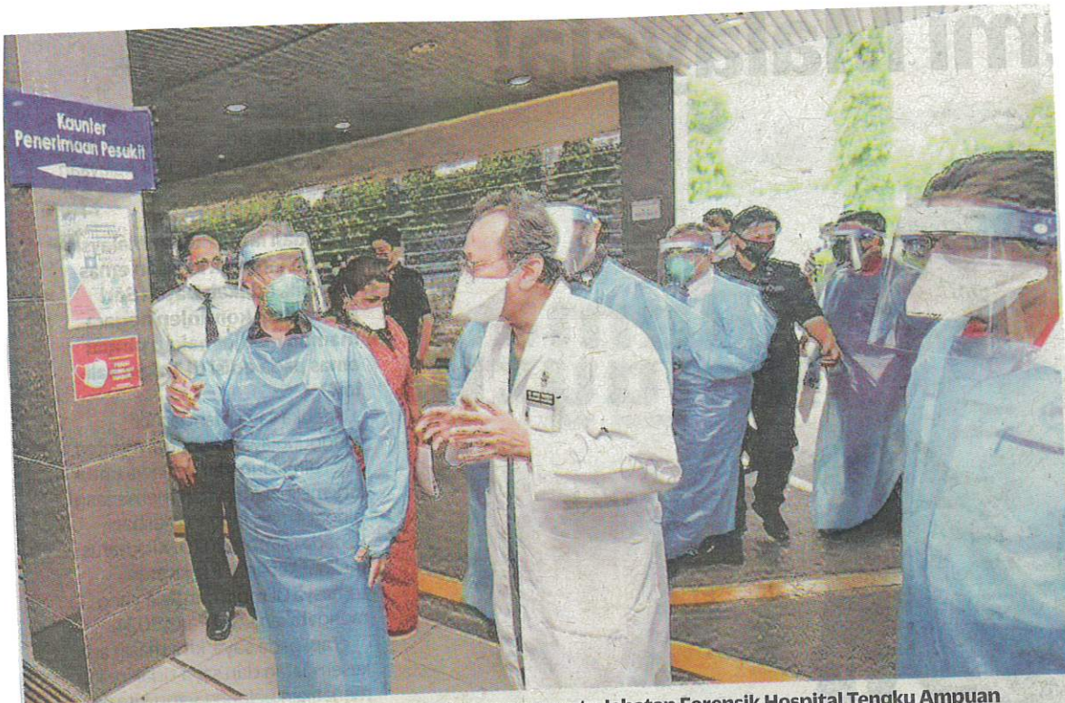
MUHYIDDIN (kiri) semasa melawat Bahagian Kecemasan serta Jabatan Forensik Hospital Tengku Ampuan Rahimah (HTAR), Klang pada Selasa lalu.

AKHBAR : KOSMO MUKA SURAT : 6 RUANGAN : NEGARA