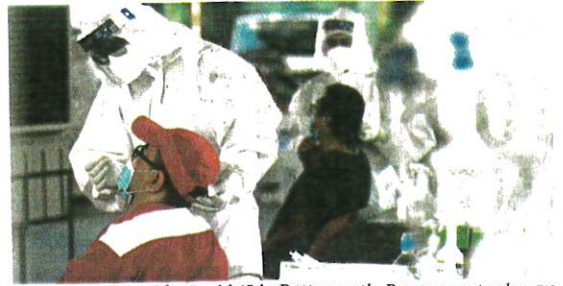
People being tested for Covid-19 in Butterworth, Penang, yesterday.

He said Putrajaya recorded the highest infectivity rate (Rt) at 1.31, much higher than the national average, which stood at 1.19. Other states which recorded an Rt of above 1.0 were Terengganu (1.25), Negri Sembilan (1.21), Kedah (1.20), Selangor (1.19), Melaka (1.18), Kuala Lumpur (1.17), Penang (1.14), Kelantan (1.11), Pahang (1.10), Perak (1.10), Sabah (1.09) and Johor (1.08).